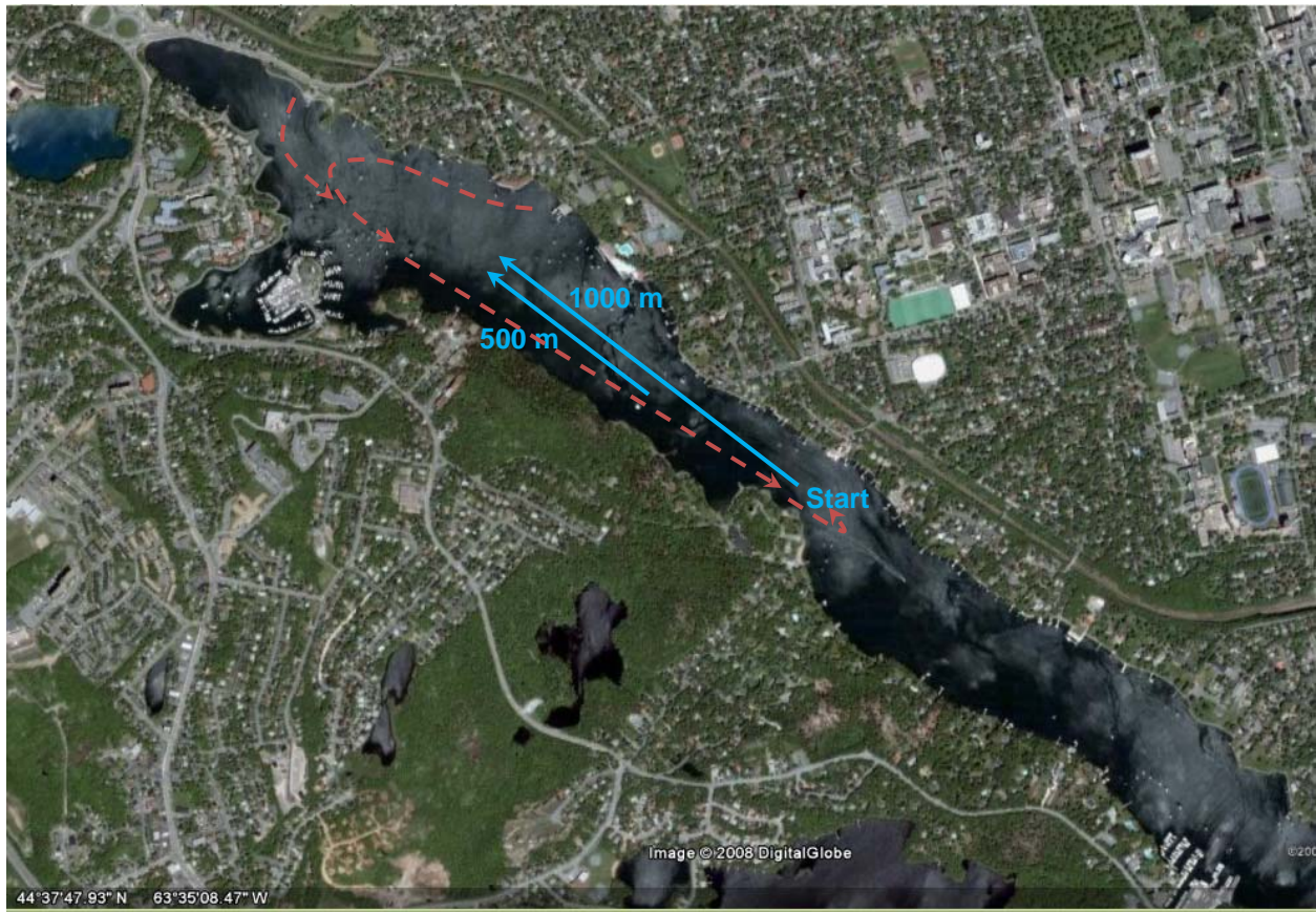
1000 m and 500 m Race Courses

Course clarifications will occur at the Safety Meeting.